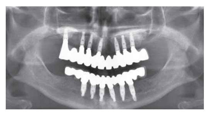
Fig. 10B: Postoperative panoramic X-ray verifying prostheses fit

implant surgery. The computer-based surgical guide can be used in completely as well as partially edentulous situations. The surgical guides can be supported by soft tissues, by bone, or by remaining teeth.