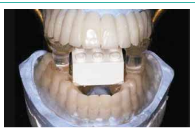
Fig. 3: Radiographic templates mounted on an articulator