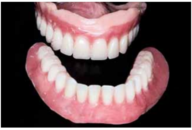
Fig. 2A: Upper and lower immediate complete dentures