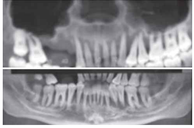
Fig. 1B: Radiographic appearance showing severe bone loss