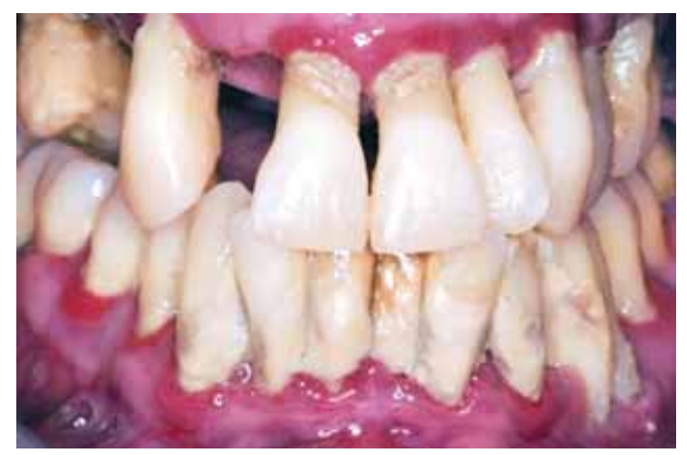
Fig. 1A: Preoperative clinical appearance showing advanced periodontal disease