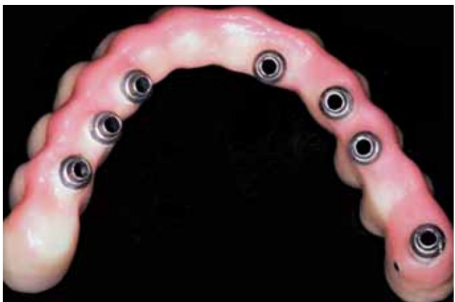
Fig. 8A: Maxillary PFM implant-supported-screwed restoration with cervical pink esthetics and buccal porcelain extension for lip support