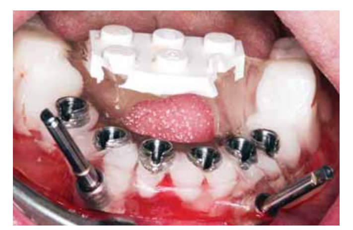
Fig. 6: Mandibular surgical guide stabilized by transfixing buccal screws

Alon-Tavor, Israel) were placed at the interforamina area with a flapless surgical approach, and were immediately loaded with a provisional restoration. The criteria for flapless surgery were: (1) Adequate amount of bone for implant placement, presence of 1 mm of bone buccolingual to the planned implant in a favorable prosthetic position as determined using the CT analysis, and (2) sufficient attached mucosa present at the surgical site such that at least 2 mm of attached gingiva would remain around the implant site circumferentially. A bilateral sinus lift procedure (Cerabone, Biomaterials GmbH, Dieburg, Germany) was performed and six months later seven implants (Touareg, Adin, Alon-Tavor, Israel) were placed with a flapless surgical approach using the same CAD/CAM surgical guidance system as used for the mandible (Fig. 7). Full-arch maxillary and mandibular impressions were made from polyether impression material (Genic, Sultan Healthcare, Hannover, Germany). The maxillary porcelain-fused-to-metal screw-retained final restoration was made with pink and white porcelain, taking in consideration, for the vertical dimension, the patient's high-lip-smile and, for the anterior-posterior horizontal dimension, the patient's need for an adequate lip-support (Figs 8A and B). The mandibular restoration was a porcelain-fused-to-metal, cement-retained fixed-denture (Fig. 9). The final prostheses were fitted and the occlusion