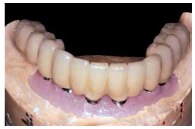
Fig. 9: Mandibular PFM implant-supported bonded restoration before delivery