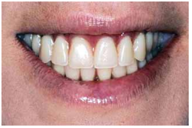
Fig. 2B: Clinical appearance of the dentures after delivery