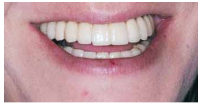
Fig. 10A: Clinical-frontal appearance of final seated restorations