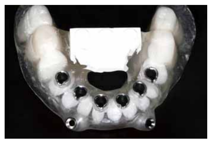
Fig. 5: Mandibular surgical guide with incorporated drill house

Full-Mouth Implant-supported Rehabilitation with a Flapless Surgical Technique: A Treatment Approach